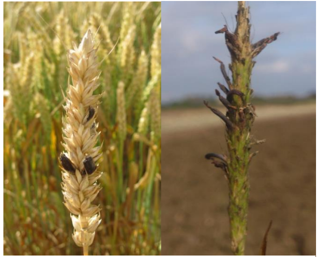
Ergot sclerotia on hexaploid wheat and on blackgrass

Ergot is caused by the fungal pathogen Claviceps purpurea . The fungus infects floral tissues of cereals, colonising the female parts of the flower and produce fungal conidiospores which are exuded from the florets in a sticky substance known as honeydew. The over-wintering fungal structures, called ergot sclerotia replace the grain. Historically ergot resulted in a human disorder known as St Anthony's Fire . Victims of St Anthony's Fire suffered from nausea, hallucinations and gangrene as a result of the toxic alkaloids produced by the fungus and are found in contaminating sclerotia.