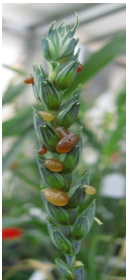
"Honeydew" containing conidia exuded from infected wheat florets

Large-scale transcriptomics studies, comparing gene expression in different female parts of the wheat flower over time, and in C. purpurea are being used to determine how the pathogen changes the cellular and biochemical environment of the plant to achieve infection and reproduce, and to determine what molecular functional processes wheat deploys to reduce pathogen infection.