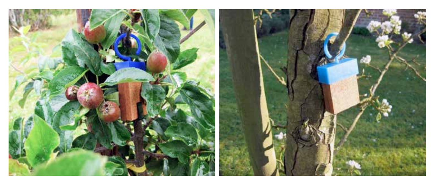
Wignest earwig refuges in place in orchard trees.