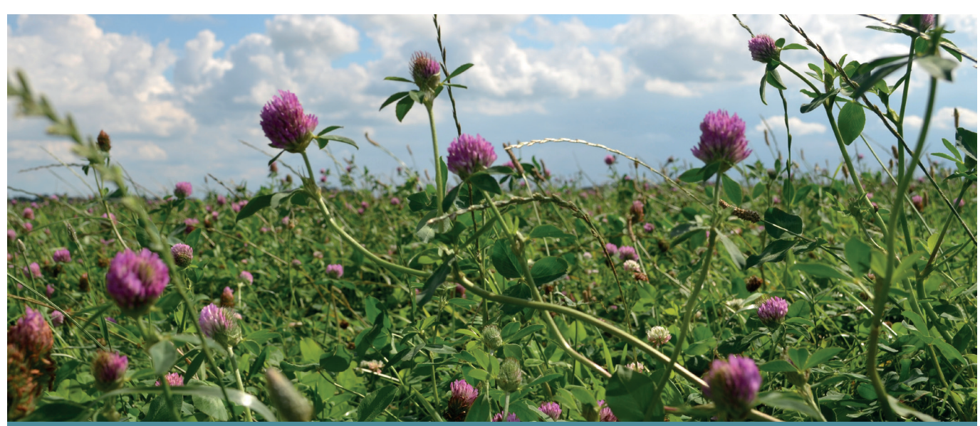
FIGURE 2 clovers, grasses and herbs combined show good growth in the BEESPOKE test sites.