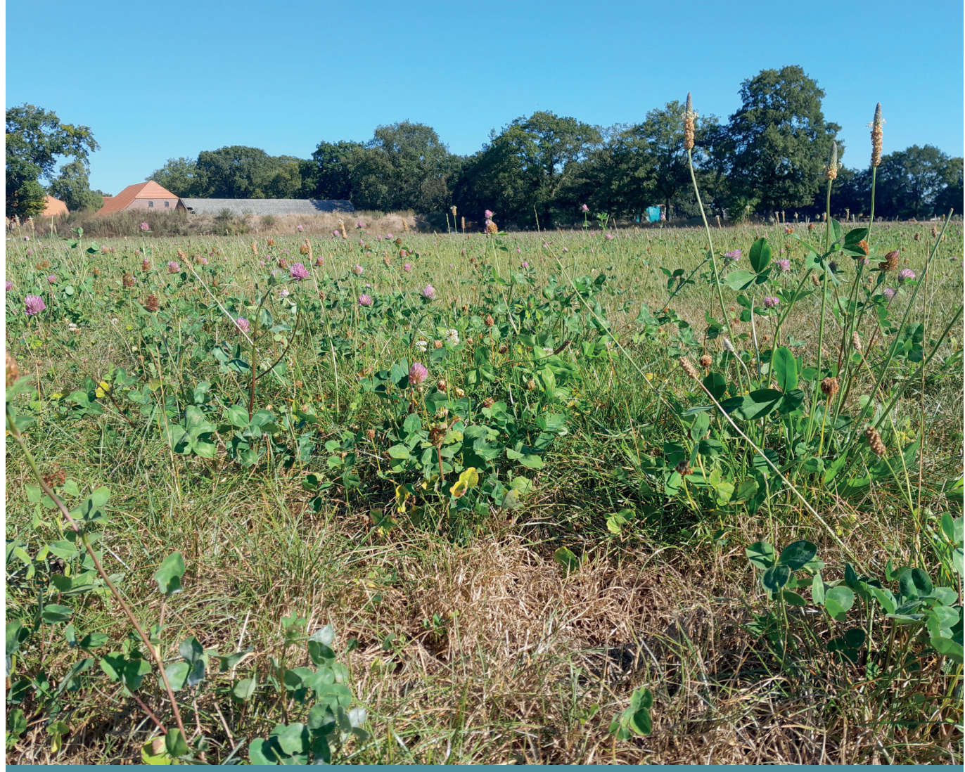
FIGURE 1 After a long drought the clovers and plantain still look fresh and green while the perennial ryegrass stopped growing.

established in the pastures of New Zealand already and currently gains more relevance in Europe. It roots very deep, making it drought resistant (FIGURE 1). It produces most biomass in summer, so the competition with grasses is reduced. Furthermore, plantain contains secondary metabolites with positive effects on dairy cows. The inflorescences are accessible to hoverflies that cannot feed on many legumes due to their deep corollas. Wild bees can also profit from the flowers. Other forbs that can be used under intensive regime are chicory and yarrow. They are drought resistant, tasteful for cattle, and a great resource for wild pollinators. Crepis biennis and C. capillaris could also be considered in more diverse seed mixes in grassland. However, these species were not tested in the BEESPOKE project.